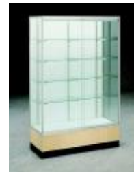
Upright Display 72”H x 20”D (4) Rows of 12” shelves