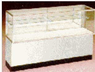
Half Vision 38”H x 20”D (1) 10” shelf